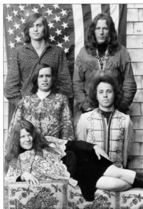
Big Brother and the Holding Company, with Janis Joplin, foreground, in the late '60s.